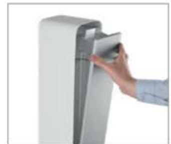
Opening the light source's cover enables direct surface disinfection.