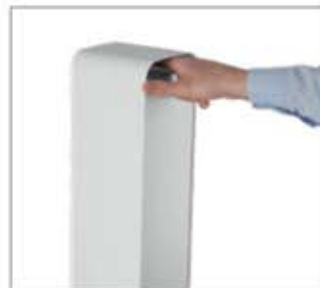
Convenient opening handle and slot for luminaire manoeuvring.