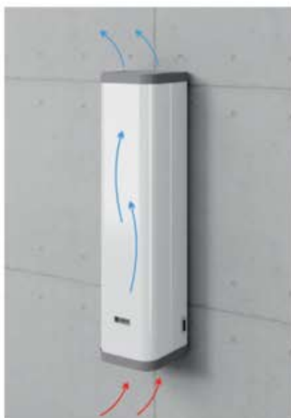
Airflow disinfection function

The design of the luminaire interior ensures perfect air flow and the highest level of disinfection efficiency. The Defender luminaire is equipped with protection against opening. Removing the top cover requires a hex key.