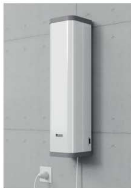
Version with cord (3 m)